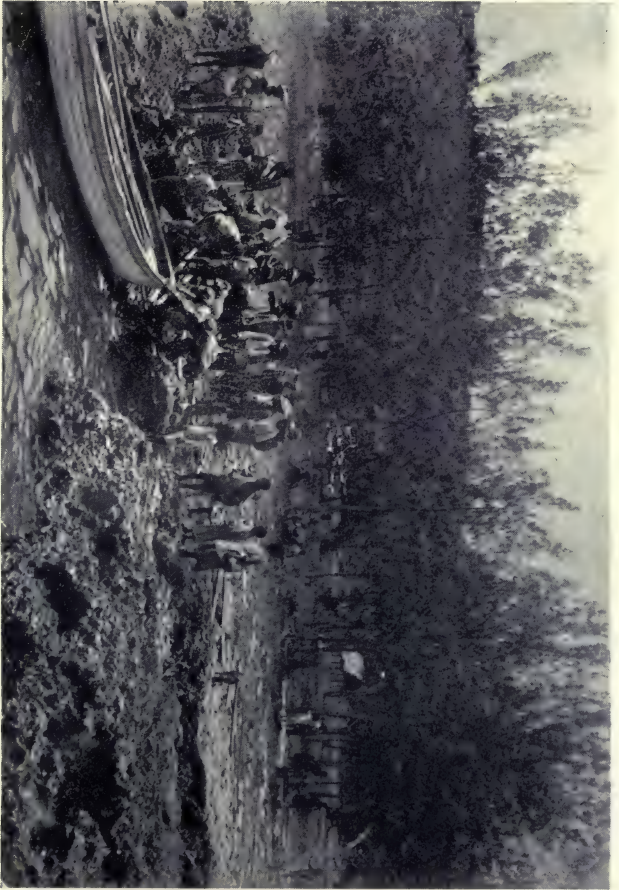
LANDING PLACE, ANIWA